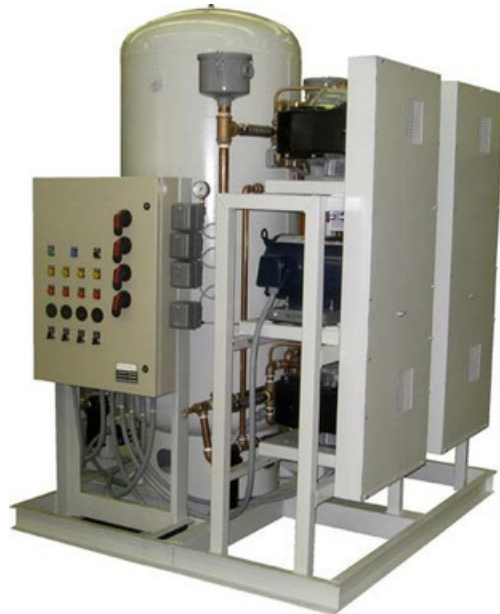
Stack-Mounted Model DMA15S120SD1 Your system can look different

Two identical banks of air treatment equipment are included, piped in parallel with by-pass valves. Each dessicant dryer sized for 100% of system capacity, provides maximum dewpoint of +32F, and includes built-in purge saver control. Each dryer includes 0.5 micron pre-filter, 0.5 micron after-filter, and pressure regulator. Digital dew point and CO monitors with alarm set points of 35F and 10 PPM are included. Demand checks are installed with each instrument.