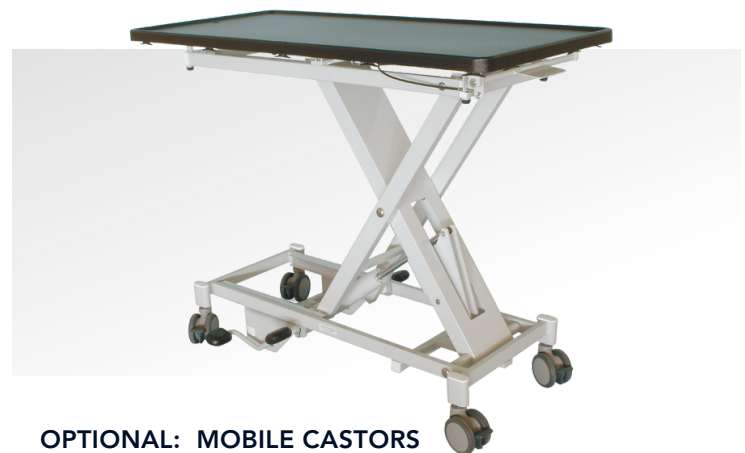
OPTIONAL: MOBILE CASTORS