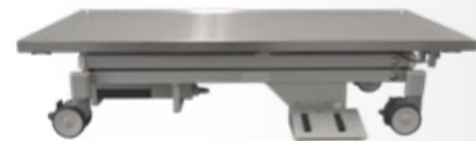
12 inch low height