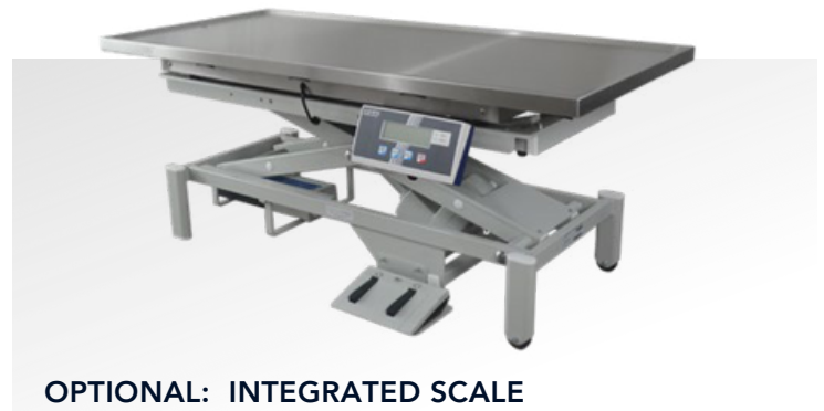
OPTIONAL: INTEGRATED SCALE