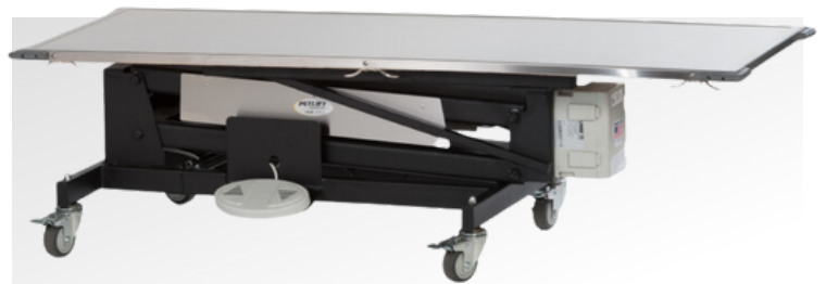
EASY ACCESS: IMPRESSIVE LOW HEIGHT ADJUSTMENT