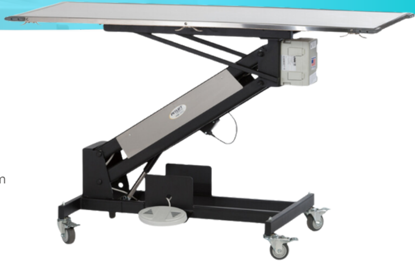
POWER LIFT WITH FOOT CONTROL